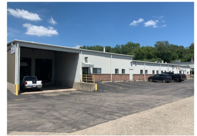
12,000 SF WAREHOUSE